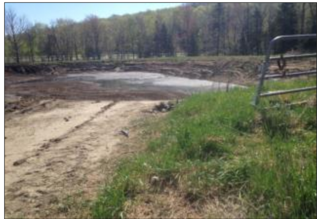
Improved manure storage