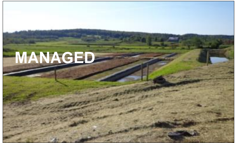
Silage leachate treatment