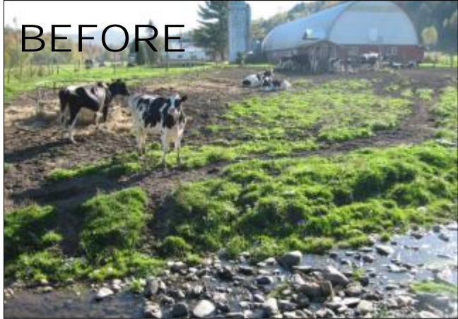
Uncontrolled livestock access to stream