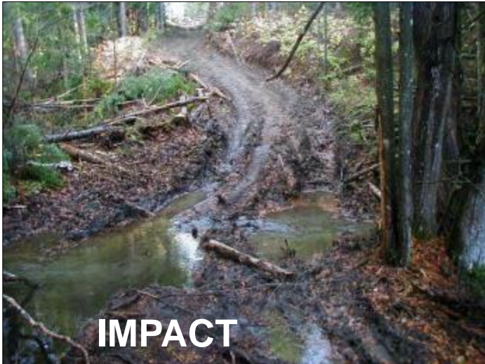
Unmanaged stream crossing at logging site