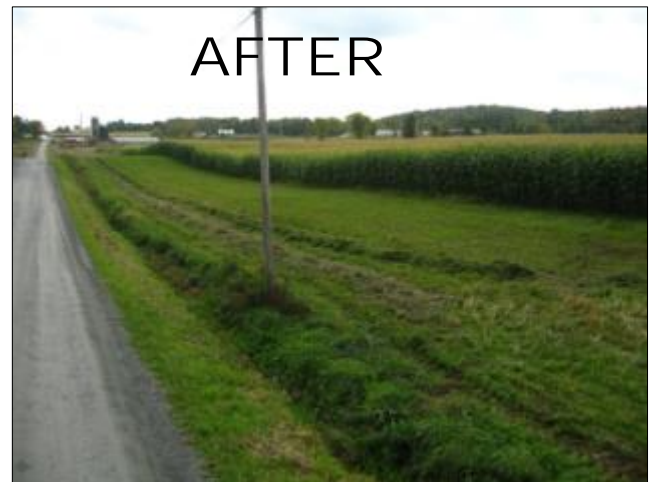
Vegetated buffer along ditch