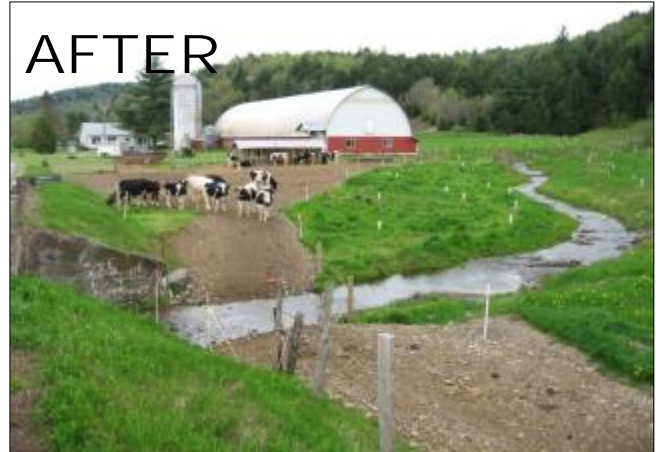
Installation of livestock fencing & buffer