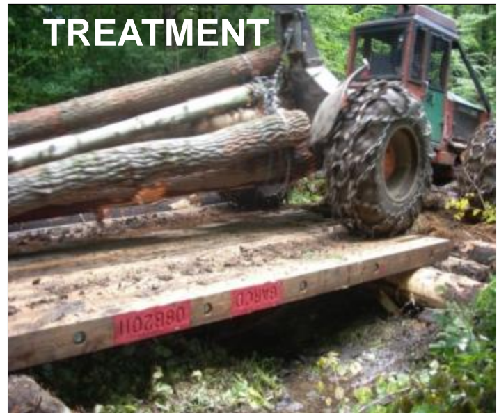
Temporary skidder bridge