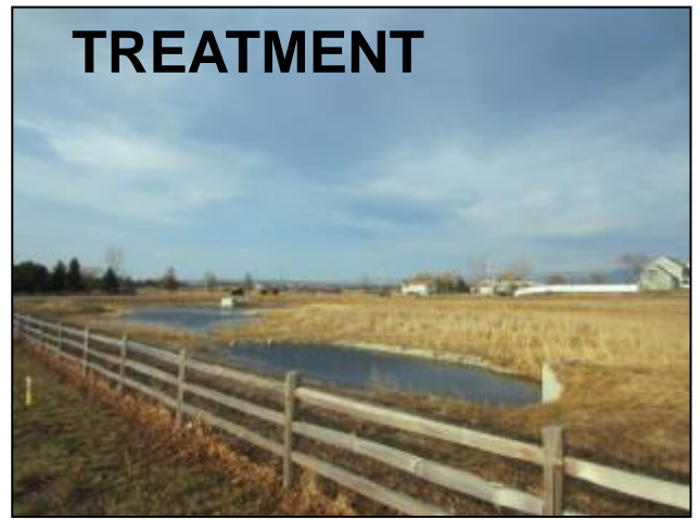
Stormwater treatment ponds