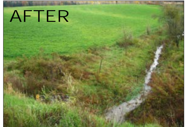
Hay crop & buffer reduce erosion and phosphorus delivery to streams