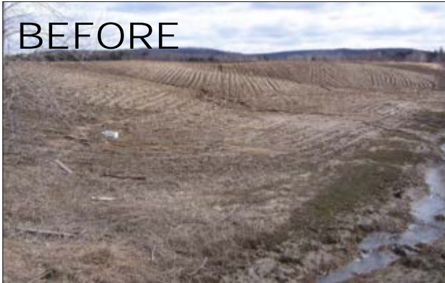
Corn crop showing bare soil & no buffer, increasing erosion and phosphorus loading