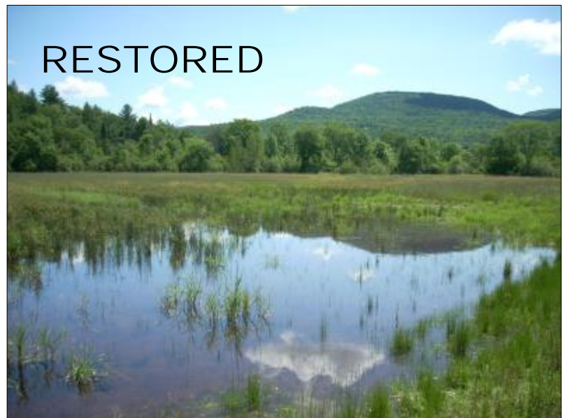
Restored wetland, former farmland