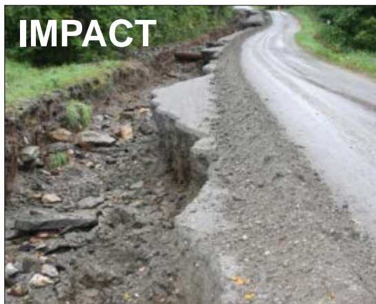
Eroding roadside ditch