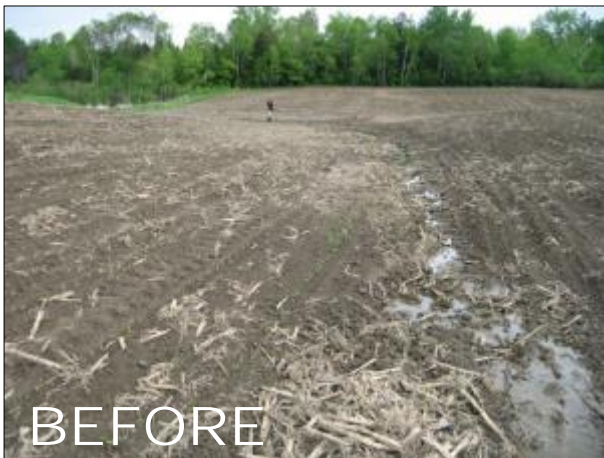
Gully erosion from concentrated water