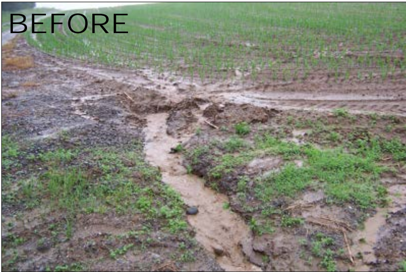
Gully formation & runoff on bare soils