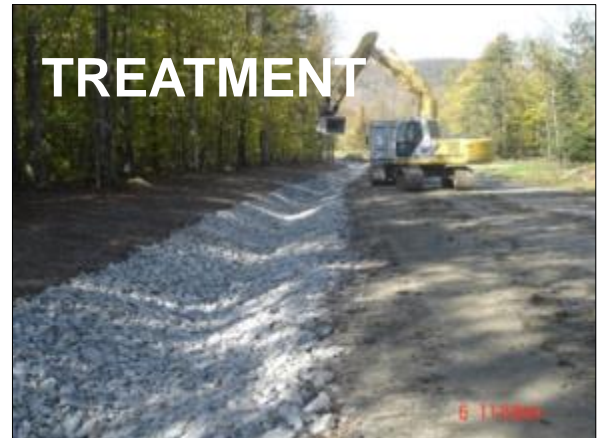
Ditch stabilization saves road and reduces erosion