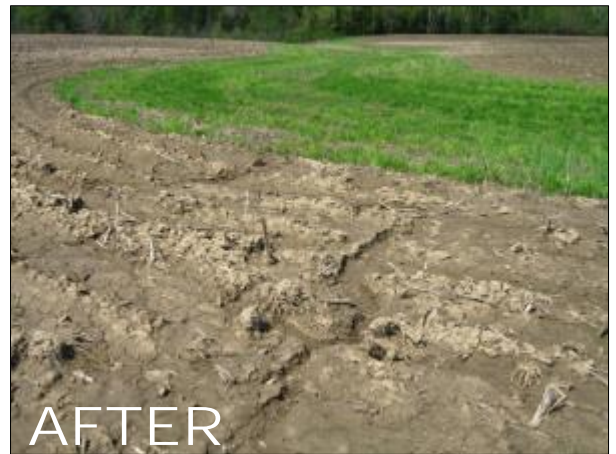
Grassed waterway to prevent gully formation