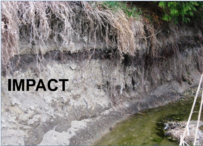
Streambank erosion from stormwater runoff