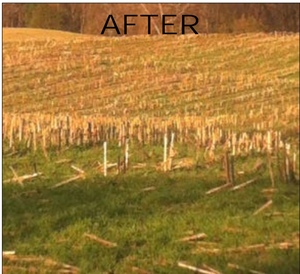
Cover crop protecting soils from weathering