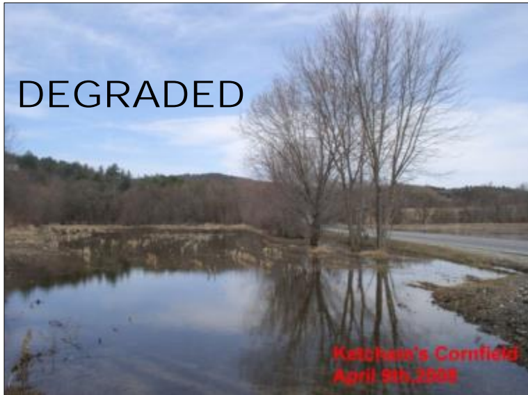
Flooded cornfield, former wetland