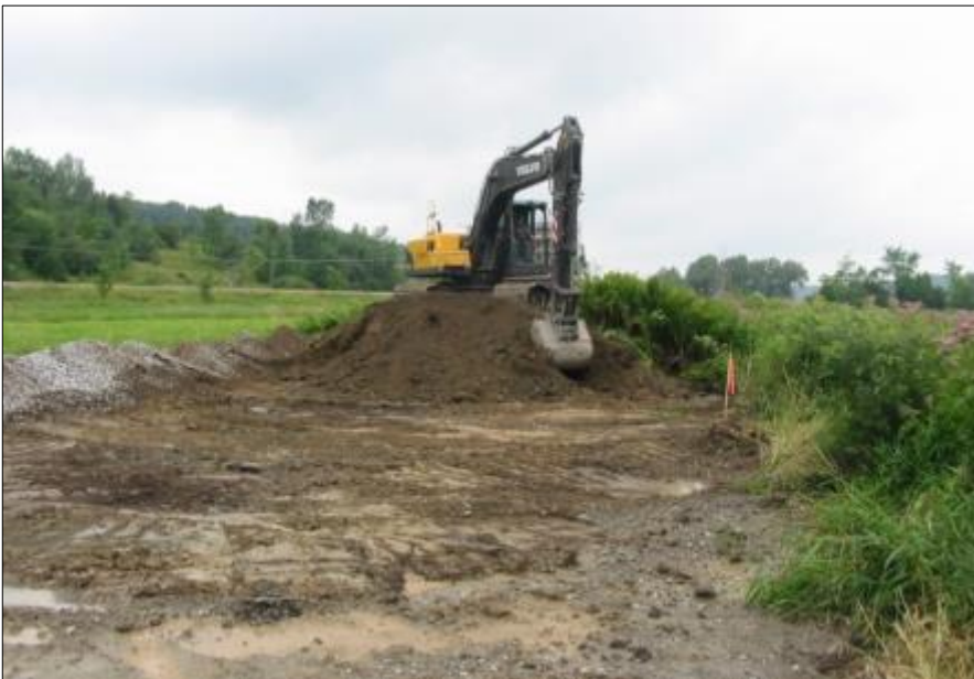
Removal of elevated railroad embankment