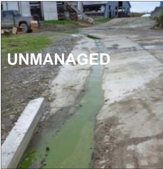
Phosphorus-laden silage leachate discharging to stream