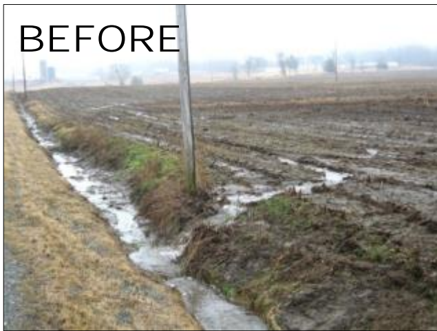
Runoff draining into ditch